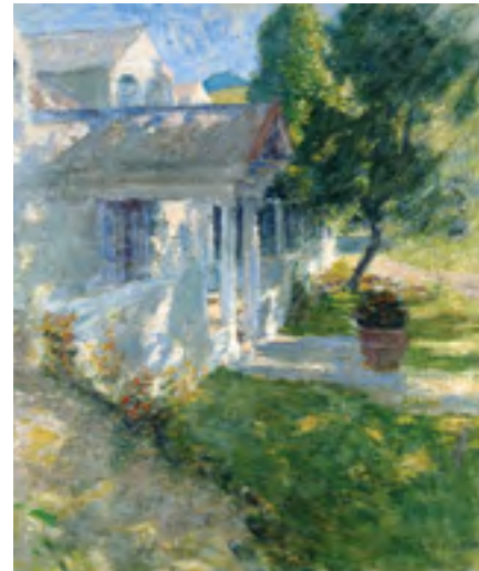
My House by John Henry Twachtman, circa 1895-1900

We are delighted to announce a $45,000 grant from the Henry Luce Foundation's American Art Program for the exhibition and catalog for Greenwich Paintings of John Henry Twachtman , an exhibition planned for fall 2020.