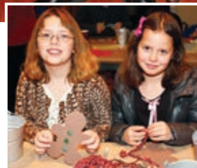
Top: Consulting with Santa. Above: The Healy Sisters enjoy holiday crafts at 2016 Candlelight Tour.