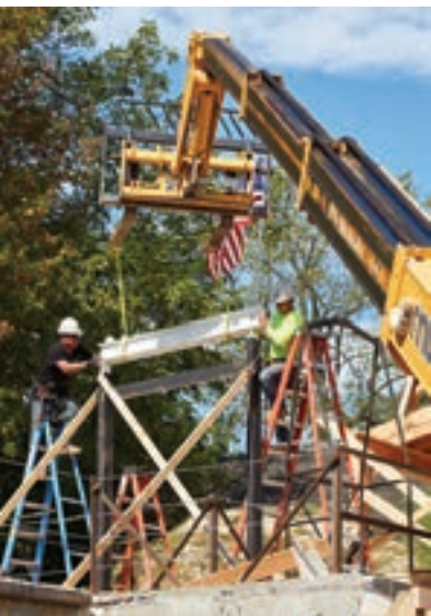
Workers hoist the signed beam

O n September 27, 2017, we celebrated a special milestone in our Capital Campaign to reimagine our campus. At a topping out ceremony (a centuries-old building tradition), elected officials, town dignitaries, Capital Campaign donors, special guests and supporters gathered to sign a beam before it was hoisted into place. The new campus is expected to be completed in fall 2018 and will include twice the parking, a welcoming lobby with an elevator to the second floor, improved exhibition and archives space, a new museum shop and a self-service cafe.