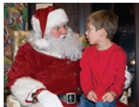
A serious exchange with Santa at last year's Candlelight Event

Tours begin at the Vanderbilt Education Center.