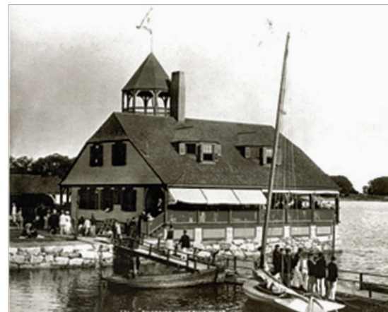
Riverside Yacht Club's first clubhouse, circa 1889