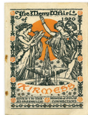
Cover of MerryWhirl program

The MerryWhirl consisted of four performances held in the Havemeyer Auditorium (the building that now houses the Board of Education) and featured a Roman pageant with local participants portraying the Emperor, Empress, Juno, Venus and Mark Antony. There was also an “Egyptian episode” featuring Cleopatra and an “Oriental episode” with the Prince and Princess of Persia. Joining these depictions from antiquity was a performance with a decidedly more “modern” (and local) flavor: the wedding of General Israel Putnam.