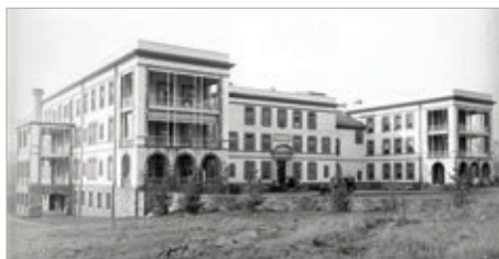
Benedict Hospital Building under construction, early 1920s

Y ou already know that our Library and Archives sits center stage in the interpretation of Greenwich history through photographs, maps, books, diaries, ephemera and more. What you may not know is that in addition to those following purely “scholarly” pursuits, local organizations frequently call upon us to provide information to assist in the development of communications, special occasions and fundraising events. The results are often surprising to researchers who no longer have historic materials in their own institutional files. Two recent requests