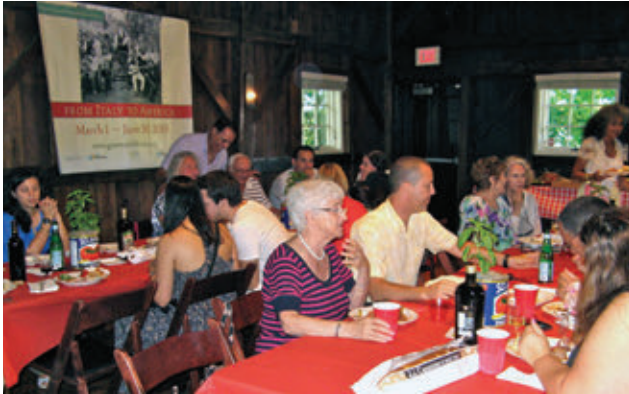
Guests chow down at last year's Festa

serve 6–8), and we'll supply the wine, musical entertainment and crafts for kids. Demonstrate your culinary skills in one of four categories: antipasti/appetizers, pasta/main dish, sides/salads, or desserts. Mangiamo!