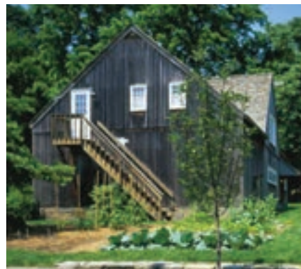
Discoveries await a new research volunteer at the William E. Finch Jr. Archives

This is a wonderful opportunity to learn about the long history of the Town of Greenwich using primary and secondary sources while assisting researchers of all ages