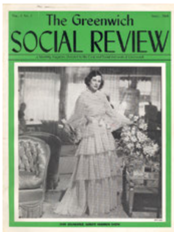
Cover of The Greenwich Social Review , October 1949

Beer, wine and light snacks will be served.