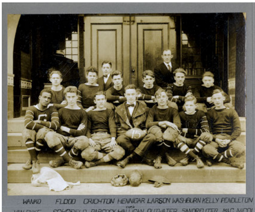
Greenwich High School Football Team, 1915.