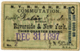
1897 Railroad Commuter Ticket