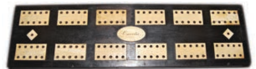
Cribbage board from the Greenwich Historical Society Collection

by hand rather than do without their favorite game.