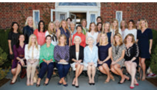
2015 Antiquarius Leadership and Volunteers