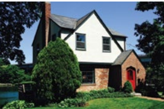
The Magdalene Bruker House, 42 Strickland Road, Cos Cob, built 1934